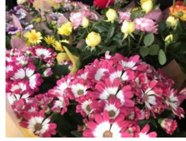
The flowers and sweets we distributed