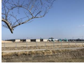
The temporary housing