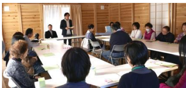
The woship service at Oshika