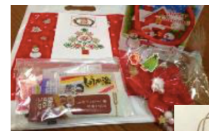
Presents given to people in Ando