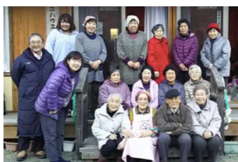
Otsuchi Number 4 Temporary Housing