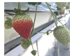
This year's strawberries