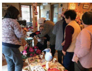
Otsuchi Number 4 Temporary Housing Gifting Flowers