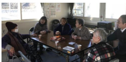
Otsuchi Number 7 Temporary Housing

On Dec 14 (Thurs) 4 members from Yamagata Church and Morioka Church visited Otsuchicho to deliver the gifts that were sent to us from throughout Japan. (Thank you for the gifts!) In the Number 7 Temporary Housing, 3 people gathered to meet us. We talked about the construction of the new houses, about moving, and about the people that have passed away. Although our conversation was a solemn one, we were able to see smiles when we handed the gifts. At the Number 14 Temporary Housing, 14 people were able to gather. We all had a wonderful meal together. We sang "Silent Night" together and had a fun time. At Ando Community Centre, 12 people were able to gather. Members from a Baptist Mission Team from Kamaishi also joined us. We are very grateful for this coincidental meeting. The temporary housing in Otsuchicho will be closed in May. Construction is continuing, with new houses and roads being built, however there are still many who cannot see what their future holds. Please continue to remember and pray for each person.