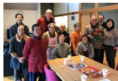
At Ando Community Centre

Dear Japan Baptist Convention Miyagi Team