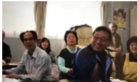
At the tea party