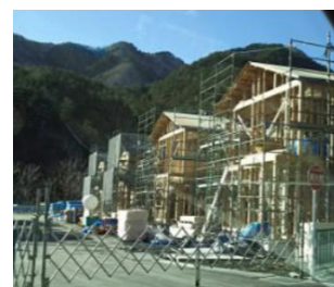
Otsuchi Development Housing