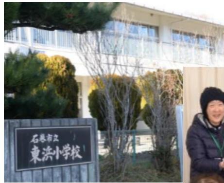
Higashihama Primary School and Ogihaman Nursery are next to each other.