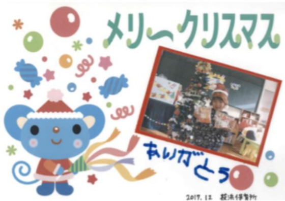
Thank you card from Ogihaman Nursery