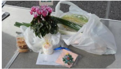
Presents sent from churches all around Japan. The three residents we met this time all have plans to move out of the temporary housing.