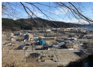
Otsuchicho in December