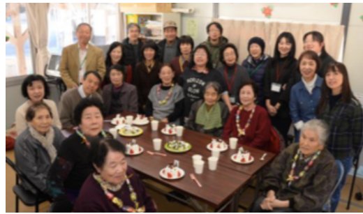
Eating hand-made Christmas cakes