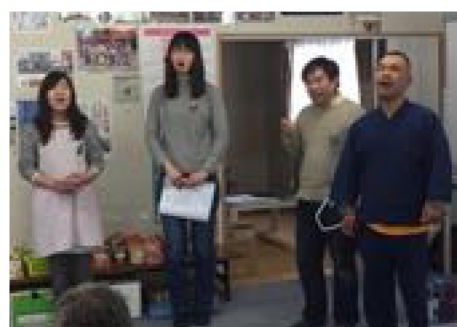
Gospel members at Midorigaoka Temporary Housing