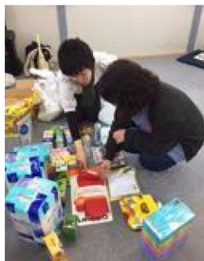
Midorigaoka Bingo Tournament. Daily goods as prizes.