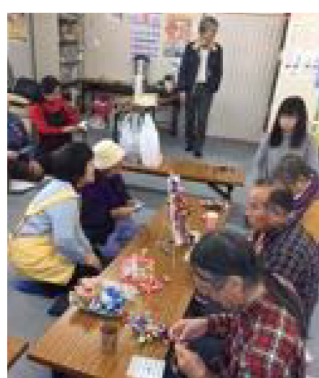
Decorating Christmas trees with chocolates.