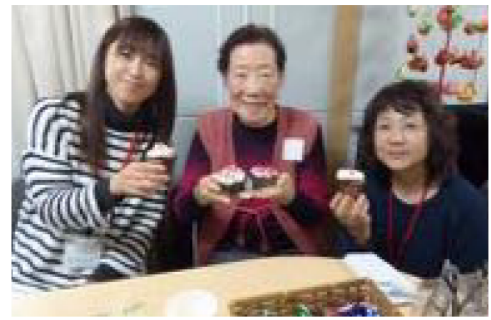
We made cupcakes at Makinohama Temporary Housing! People from Kyubunhama joined too.