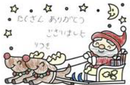
Children from the Oginohama Nursery. And their thank you card (below)