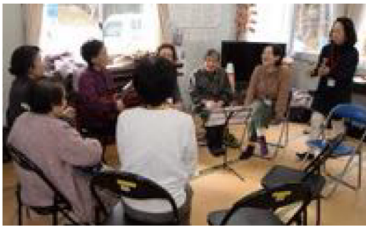
Christmas music therapy at Makinohama Temporary Housing