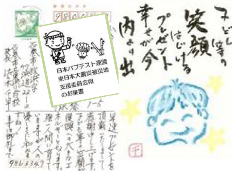
Thank you post card from the headmaster of Ishinomaki Higashihama Primary School.