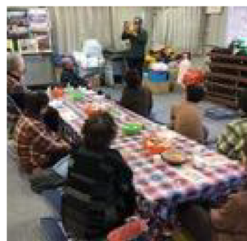
This year we once again celebrated Jesus' nativity.