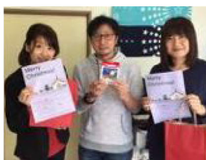
We visited about 20 households that had left the Miyamae Temporary Housing with Christmas gifts.