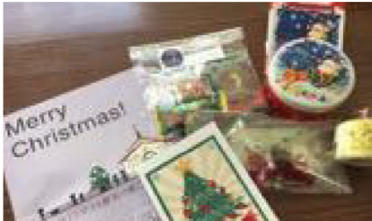
Christmas gifts, cards, and flowers from churches around Japan