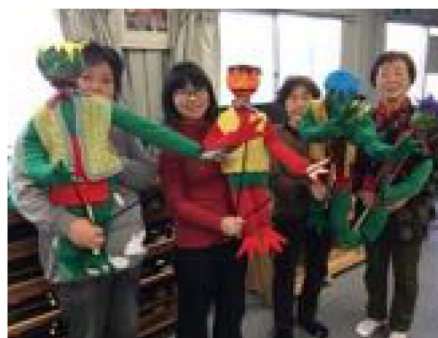
At the Ando temporary housing. The local puppet play, "Ando Sisters" wore Christmas colors.