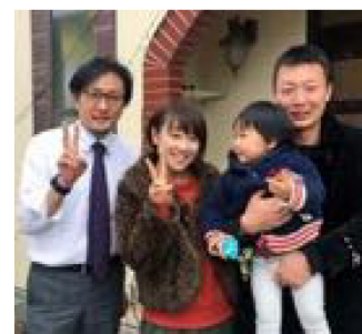
The couple that met at Miyamae Temporary Housing and joined our Christmas service for the first time.