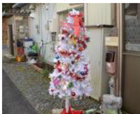
Christmas tree and candles at the Makinohama Temporary Housing