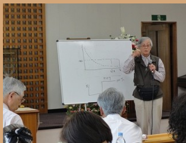
●Lecture held to discuss the nuclear power plant accident ( May 11, 2011, Fukushima)

One of the gravest issues stemming from the Tokyo Electric Power Company's Fukushima Daiichi nuclear power plant accident is the fact that the damage it caused is preventing communities from starting the recovery process. The radiation contamination is creating division and barriers among the people, and this is becoming an emotional burden for them. Recognizing these as our own problems, we plan to keep tackling the issues surrounding the nuclear power plant accident henceforth. We will further pursue our efforts to purchase Geiger counters and set them up where they are needed.