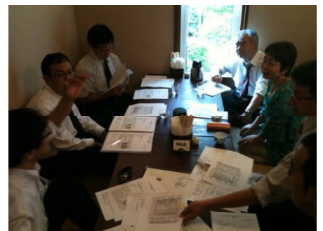
●Meeting between the Aomori and Iwate teams