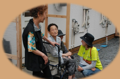
●Volunteers talking to temporary housing residents