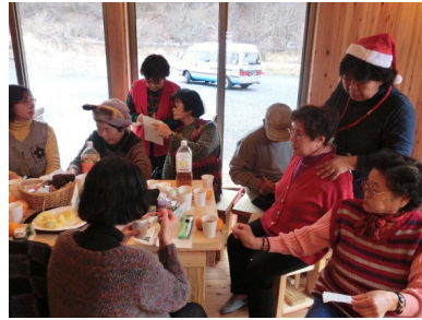
●Christmas Party at the Otsuchi temporary housing complex (Iwate prefecture)