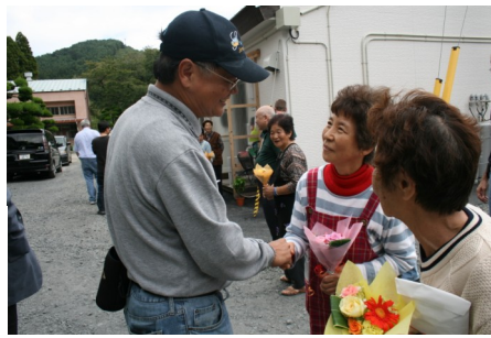
●A support team from overseas visits temporary housing community (Ando, Iwate Prefecture)

We have been receiving endless support from our overseas friends, starting form immediately after the earthquake. In September, the Baptist Roundtable Summit on Recovery Efforts was held at the JBC office, and Baptist groups gathered from around the world. Even now, our Baptist brothers and sisters are praying for Japan and sending their support.