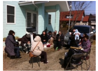
●Sendai-Taitomi baptist church's Sunday worship on March 13.