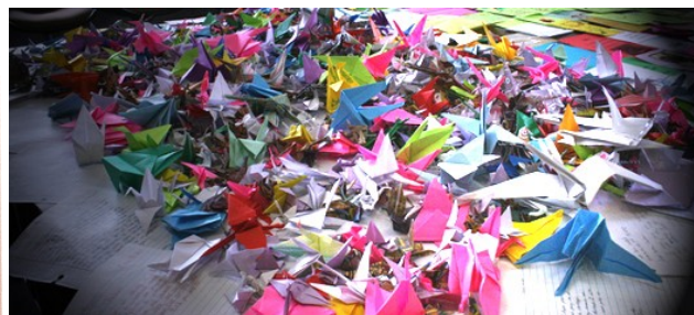
● Paper cranes send from churches all over Japan