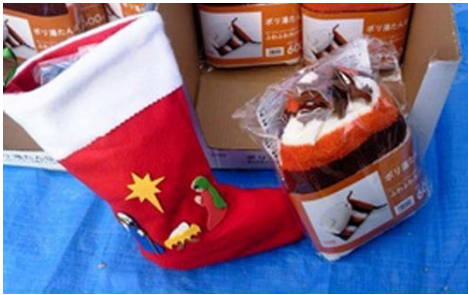
●Presents handed out at the Midorigaoka temporary housing complex (Fukushima prefecture)