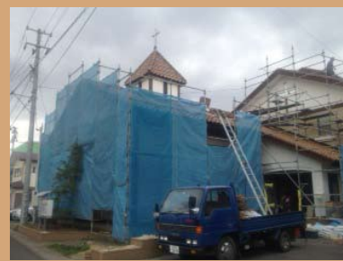
●Scaffolding set up to repair roof tiles at Koriyama Cosmos-dori Church