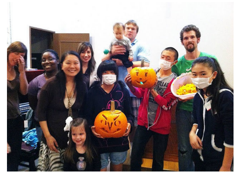
●Teams from Hawaii and Bangkok held a support program at Oshika Community Center (Miyagi Prefecture)