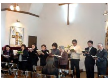
●Service at Taitomi Church

On Sunday, March 11th, 2012, various services and prayer meetings were held in the afflicted areas in remembrance of the disaster. The issues that we face are grave, however, we are going forward one step at a time. The churches in these areas continue their activities, putting their faith in the Lord Jesus who walks before us.