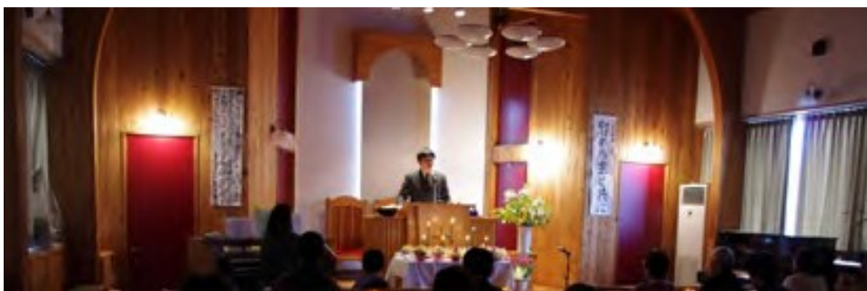
●Memorial Service held at Koriyama Cosmos-dori Church