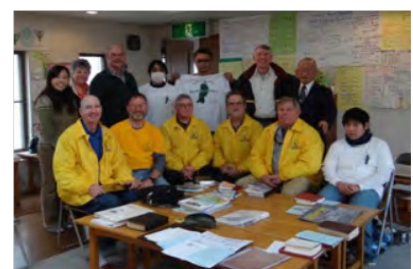
●Service held at Yoshioka Mission Point