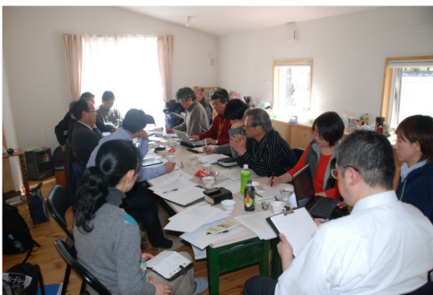
●April 2011 First meeting between JBC Tohoku Association and Disaster Relief Head-quarter members