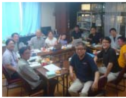
●Meeting at Tohno Volunteer Center