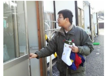
●Handing out presents at the Nodamura temporary housing complex (Iwate prefecture)