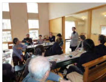
●3.11 assembly at Nankodai Church