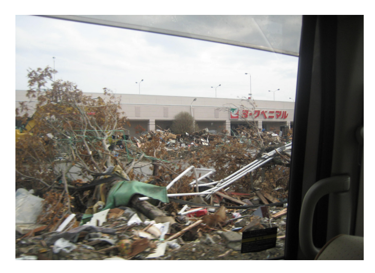
May of 2011