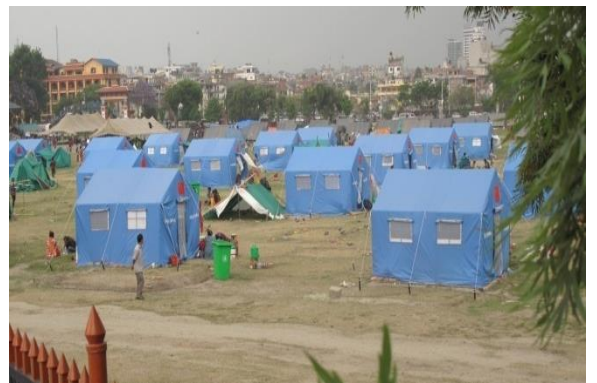
Relief tents at public ground, Kathmandu